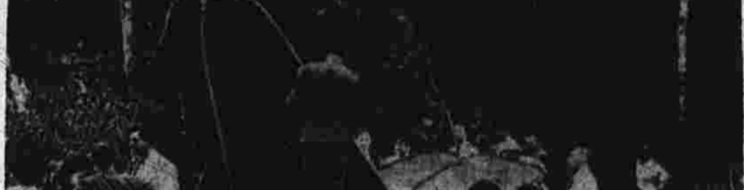
Russian sources say these are foreign journalists inspecting a German warplane which was brought down during an air raid on Moscow. (Picture by radio from Moscow to New York)

House Group Favors More Service Time Washington, July 30.—(AP)—The House Military Committee today approved legislation to retain Selective Training and Service Act, National Guardmen, Reserve officers and enlisted personnel of the Army for military training beyond one year.